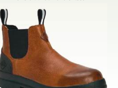
Men's CCLP-901 Chore Chelsea PT