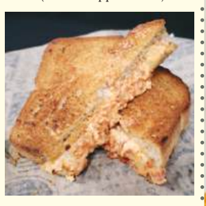
Café Hours: Mon., Tues., Thurs., Fri. 8am-8pm; Wed. & Sat. 8am-5pm