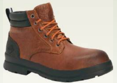
Men's CLLP-901 Chore Lace PT